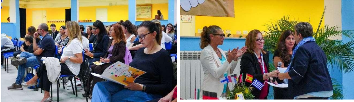
Figure n.9 – Some moments during the final discussion and certificate delivery