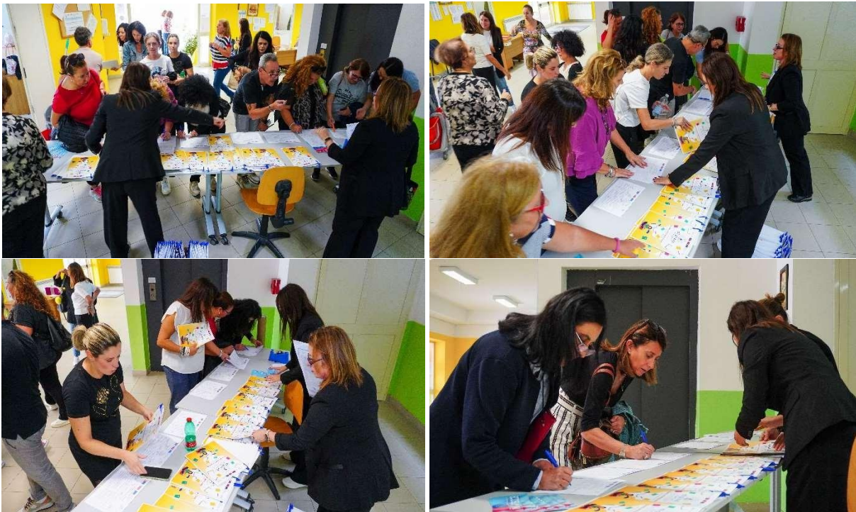
Figure n.3 – Some moments during the participants' registration.

At the beginning of the final conference, the participants had to register their presence on the signature list and receive the project pack, as shown in the following Figures.