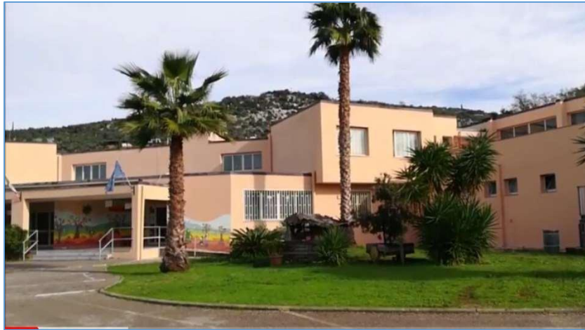
Figure n.1 – The main entrance of the Scuola Primaria “Don Adriano Bragazzi” Terracina.

This report is a part of the WP5 - WP5 - Evaluation Programme, and it describes the final conference organised by EU-Track in Terracina (Italy) on 16/10/2024. The event was organised in the framework of the European initiative Erasmus Days 2024 (Figure n.1) at Scuola Primaria “Don Adriano Bragazzi” – Terracina.