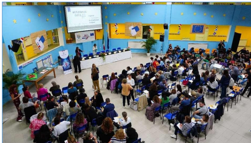
Figure n.2 – The overview of the audience before the event started

The event gathered n.97 participants, including principals, teachers, and public authorities in education and social services at local and regional levels. The following Figure shows the audience before the event started.