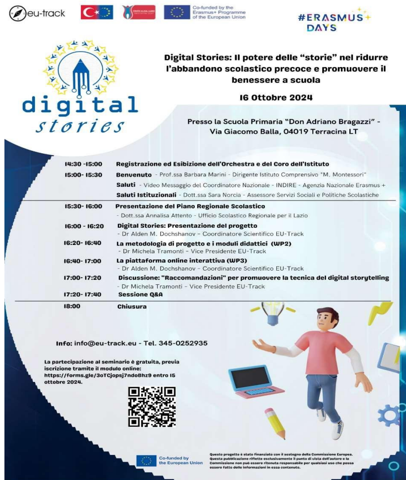
Figure n.5 – Agenda of the event distributed to the participant

The event was scheduled according to the following agenda: